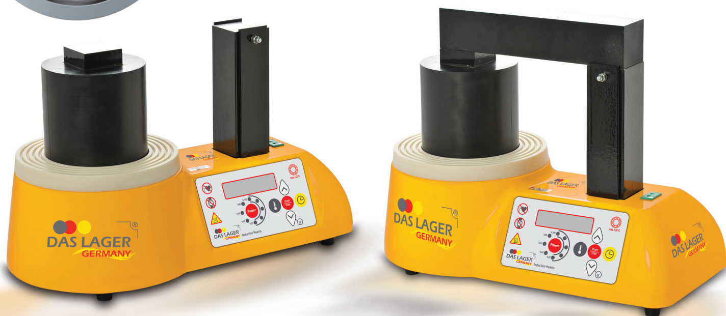
Das Lager Germany New Generation Induction Heaters